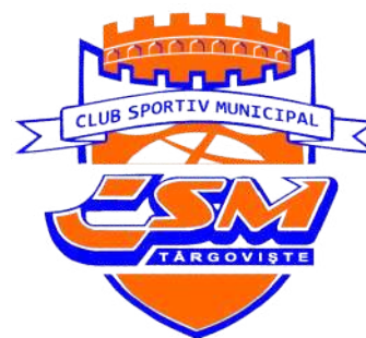
Club Sportiv Municipal Târgoviște