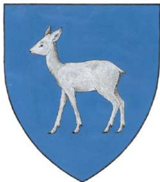
CONSILIUL JUDEȚEAN DÂMBOVIȚA